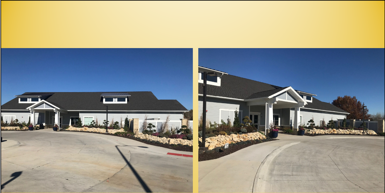
Finkbine Clubhouse – Front Entrance