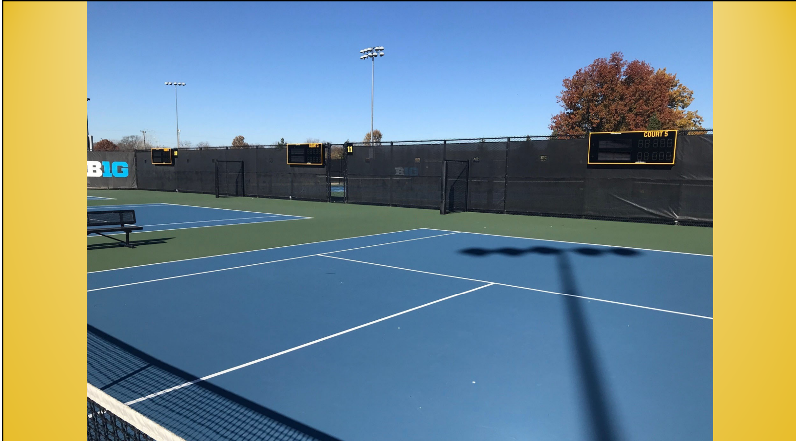
HTRC- Court Resurfacing and Scoreboard Addition